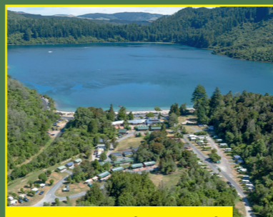
Lake Tikitapu (Blue Lake)